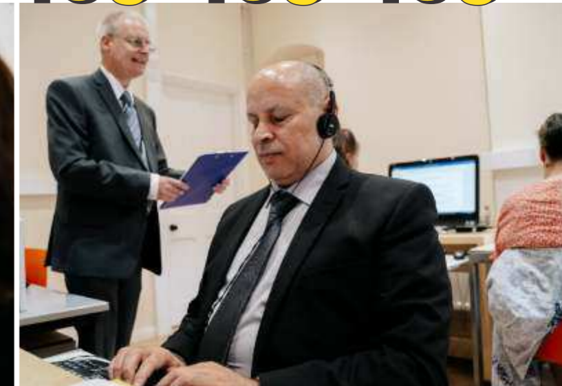
Above left: MAB has a Rapid Response Counselling programme that helps people who find themselves in a crisis about losing their sight. Right: our Employment Service helps people build the confidence they need to enter the job market.

Council. Then, the Local Government Act came into force which recognised MAB as an agent of the County Council. As part of this formal role MAB was entrusted with assigning help from the Council's domiciliary assistance scheme, where by a single person or couple were entitled to an income if they were blind. This level of responsibility demonstrated the high regard that MAB was held in by authorities and the deep grassroots connections it had.