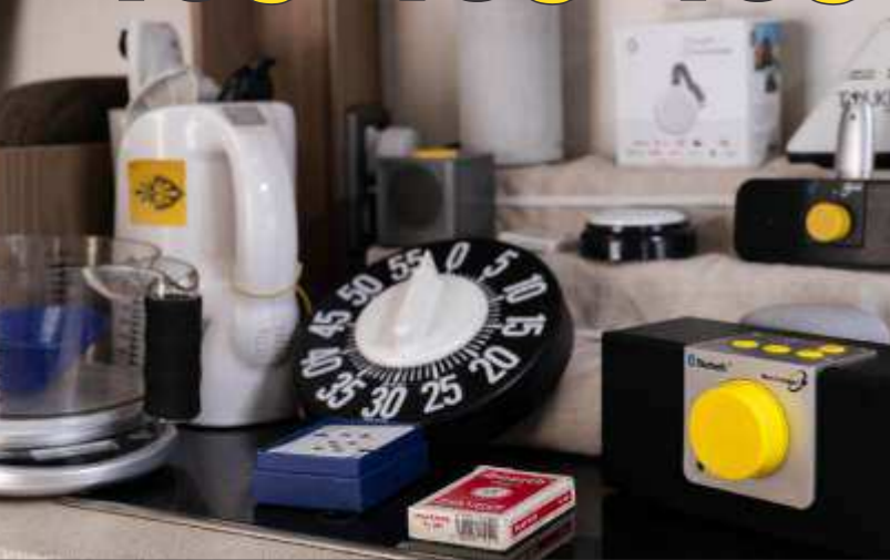
Some of the assistive devices we exhibit from our Mobile Resource Unit.