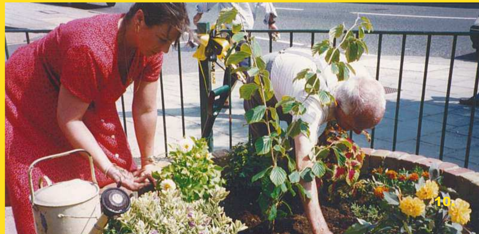
MAB volunteers working to build a sensory garden in South Harrow in 1995.

The 1960's were a time of great upheaval and concern for MAB when the Middlesex County Council was abolished. There was worry about whether or not the local authorities had the staff and skills to provide for people with visual impairment in the way that MAB had been able to